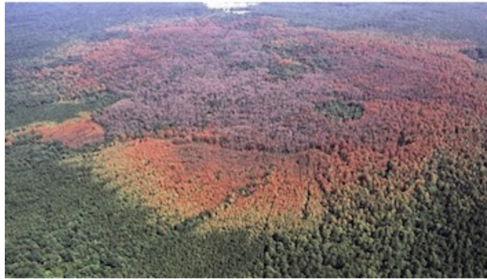
Southern Pine Beetle damage in the New Jersey Pine Barrens