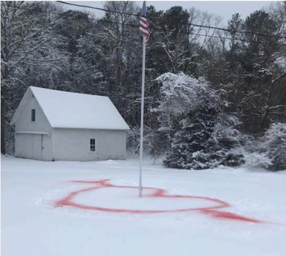
Happy Valentine's Day from the Six Ponds.

Chili Cook-off and Stories was a great success