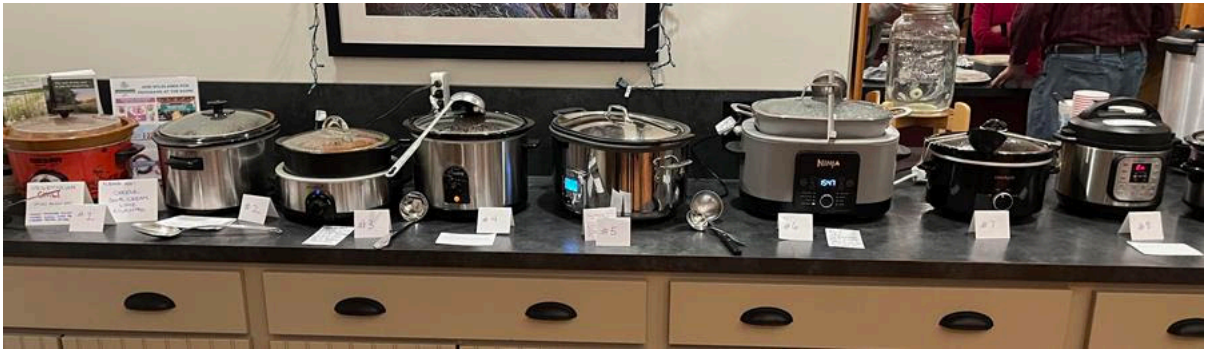
The array of chili warm and ready for the Six Ponds Chili Cookoff and Story-telling on January 24.