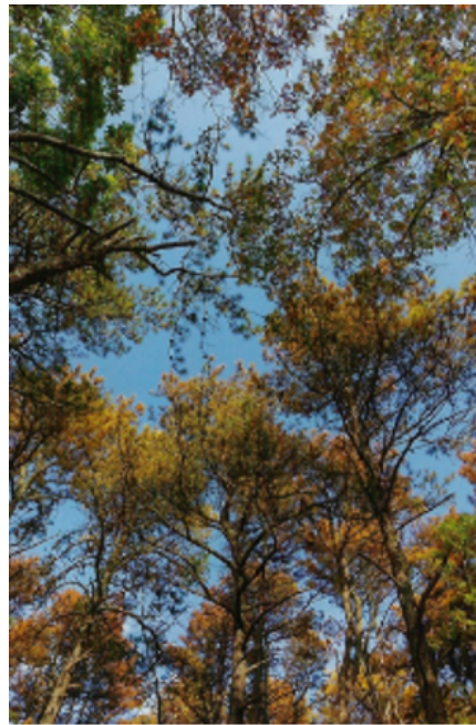
Infected Pitch Pines, Mashpee, MA.