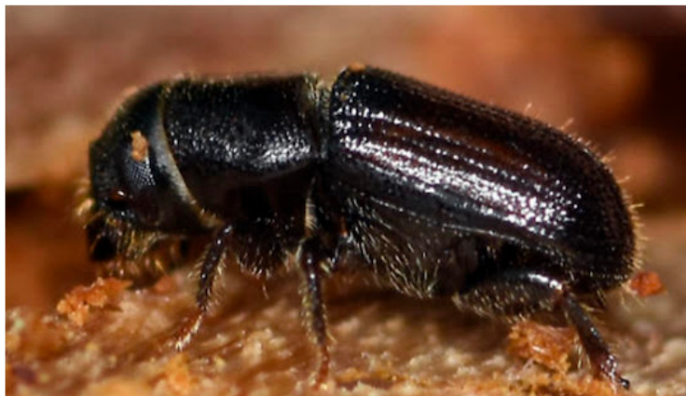
Southern Pine Beetle – actual size, about the same a grain of rice:

Several state and local agencies are on this, including MassWildlife, DCR, Nantucket Conservation Foundation (NCF), Mass Audubon, the Massachusetts Army National Guard, the National Park Service, and the US Fish and Wildlife Service. As we receive more information we will share updates. MassWildlife assures us that this is not all bad news. The arrival of SPB is shining a light on the health of one our most important ecosystems. Pine Barrens have long been neglected and their health has degraded. This crisis presents an opportunity to demand long overdue action. This threat might be the catalyst needed to restore one of our most treasured landscapes.