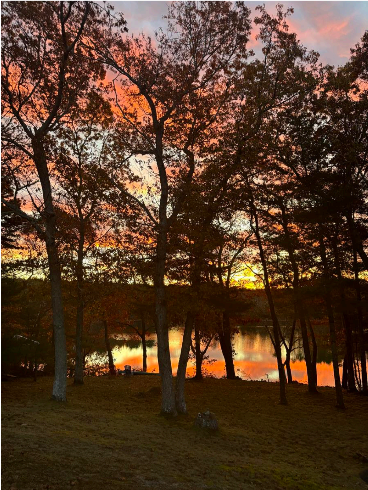
A colorful sunrise on Bloody Pond.