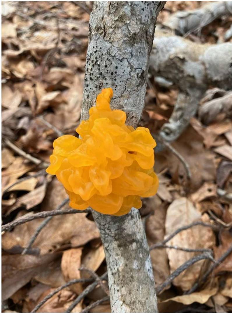
Orange Fungus on beech limb.