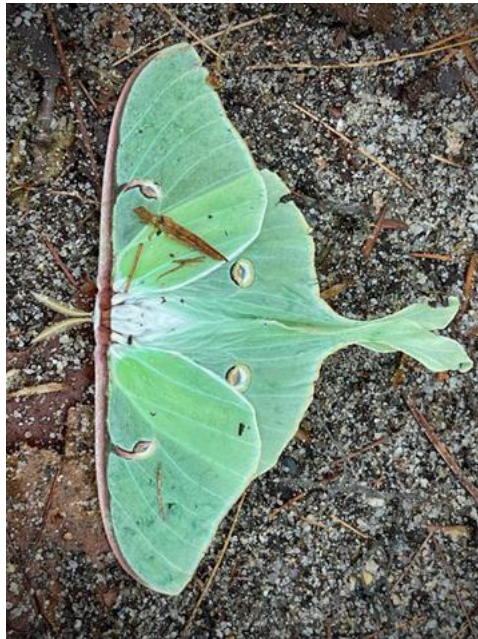
Luna moth, Actias luna .

bi·o·di·ver·si·ty /,bīō,dīvərsədē/ noun 1.the variety of life in the world or in a particular habitat or ecosystem.